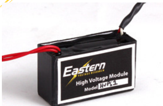
High Voltage Module, HVPS1