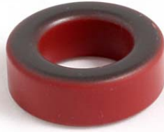
flexiBrute Powered Iron Core 2-1