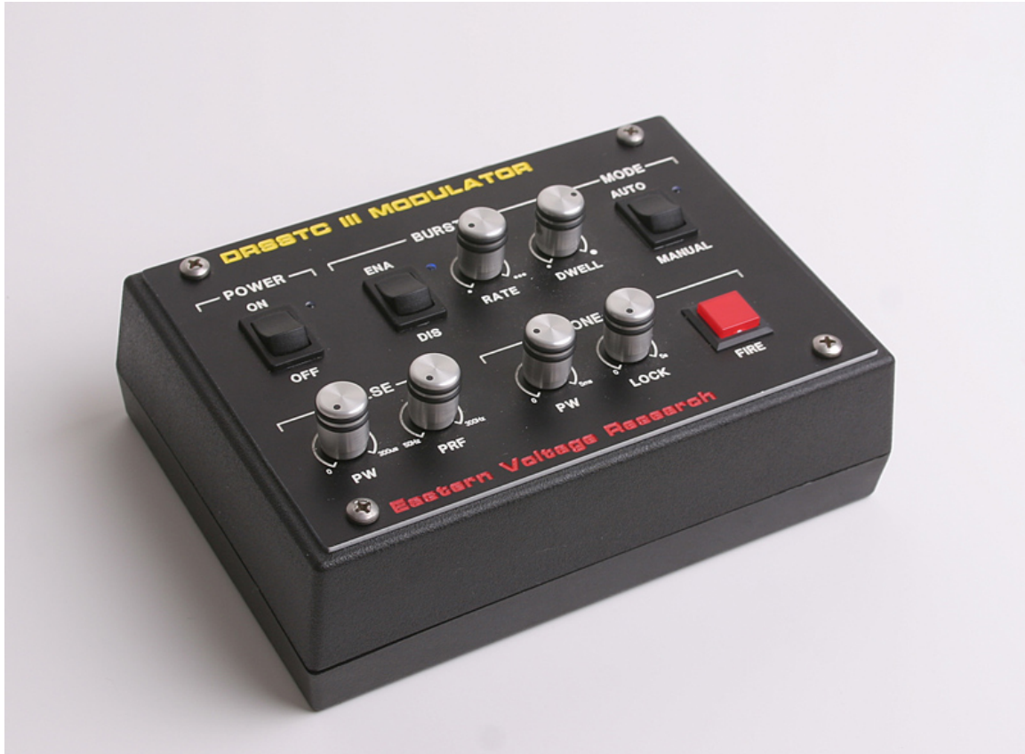
Advanced Modulator System (shown with Front Panel)

The Advanced Modulator Board Kit contains the PCB board required to build the Advanced Modulator system. This board has been professionally designed and thoroughly tested to ensure maximum performance.